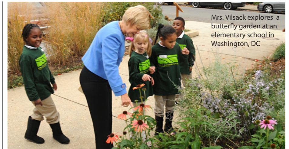
Mrs. Vilsack explores a butterfly garden at an elementary school in Washington, DC