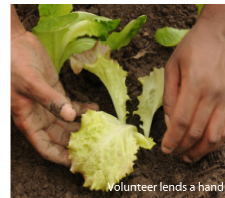
Volunteer lends a hand

People's Gardens promote sustainable practices. They improve water quality, improve soil health and create shelter and nesting habitat for wildlife.