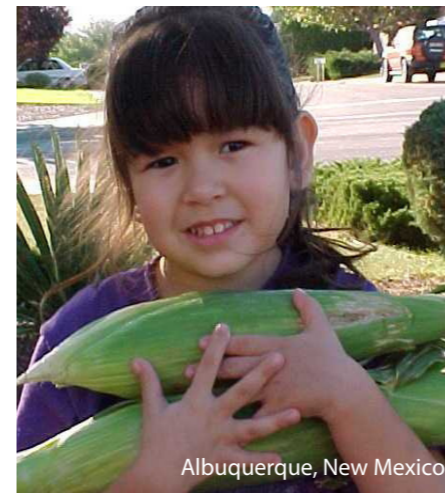
Albuquerque, New Mexico

When Abraham Lincoln founded USDA in 1862, he referred to it as "The People's Department." It is a description that is as true today as it was then. USDA touches the lives of Americans every day. To commemorate this significant link to all Americans, Secretary of Agriculture Tom Vilsack, broke ground on the first People's Garden at USDA Headquarters on February 12, 2009, the bicentennial of Lincoln's birthday. Today, the entire grounds are a part of this garden. Plans are being developed to create rooftop and rain gardens and incorporate pollinator, wildlife, and edible components throughout the landscape. The garden at USDA headquarters, as well as gardens at all USDA facilities, will demonstrate sustainable conservation practices and will be used to educate and engage the public.